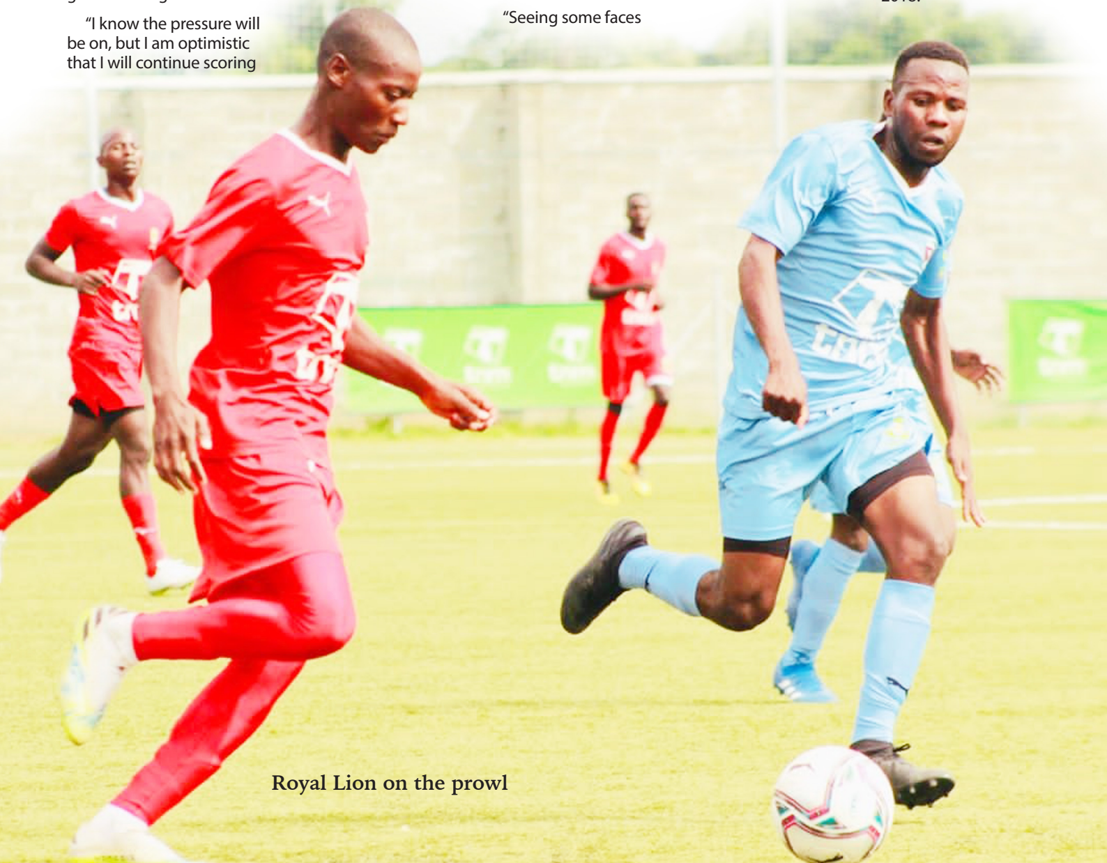
Royal Lion on the prowl

Royal scored an impressive 43 goals in the 2019 ThumbsUp League to help the Lions re-gain promotion into the top flight Super League after getting relegated in 2018. 📺