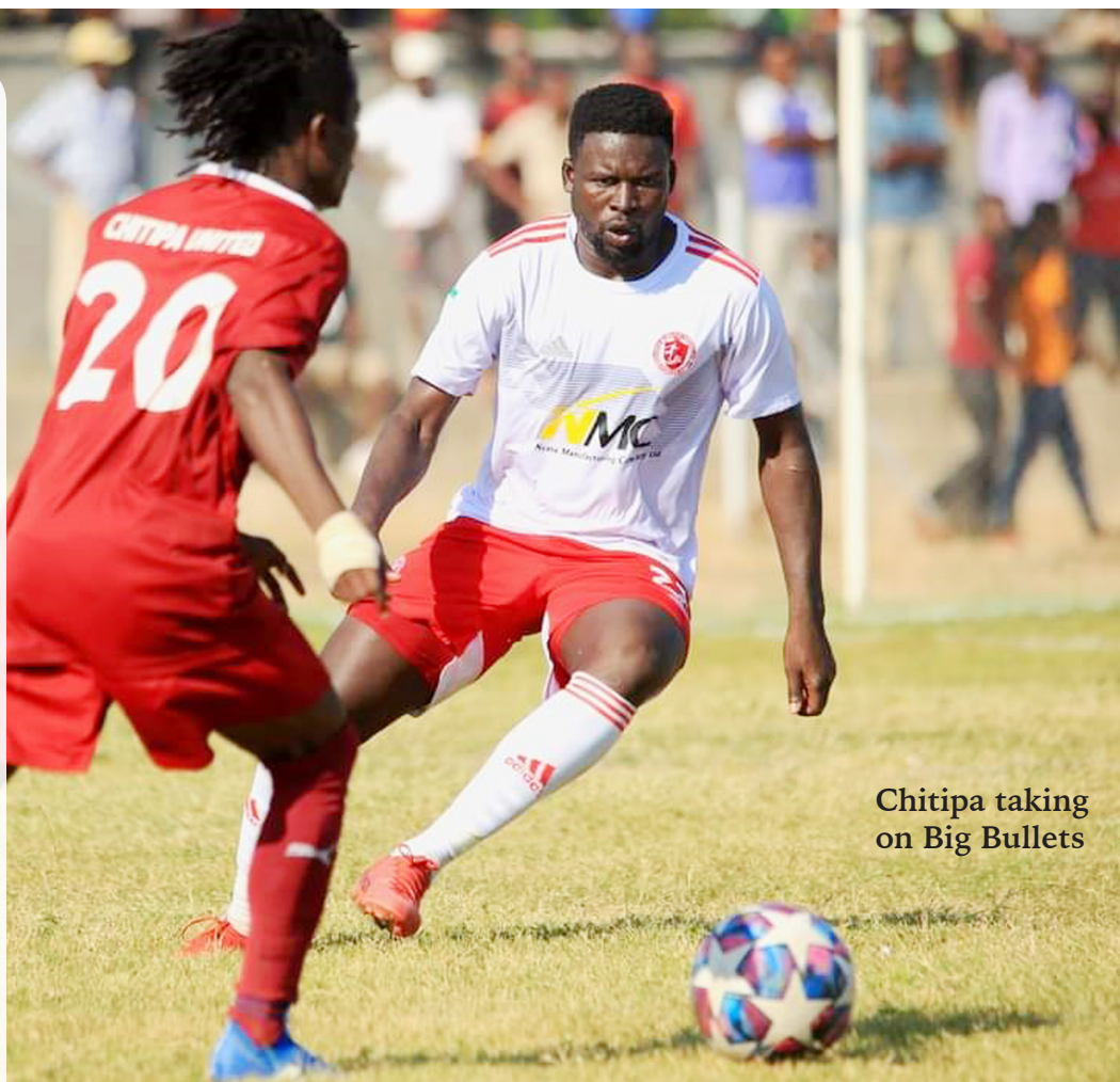
Chitipa taking on Big Bullets