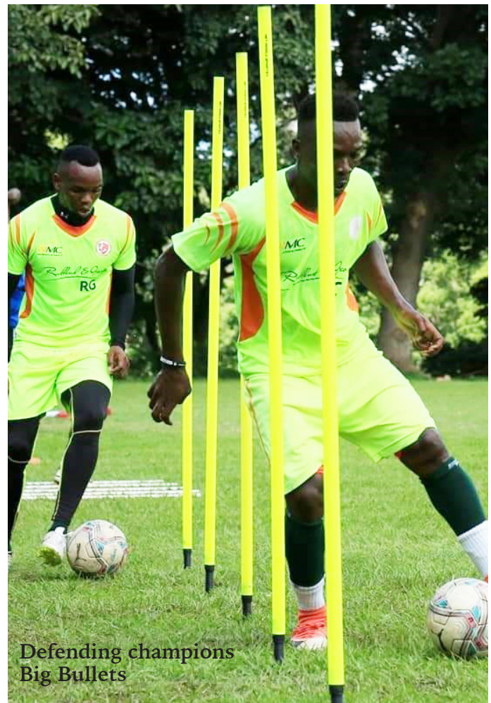
Defending champions Big Bullets